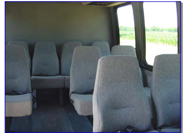
Front cabin offers seating for twelve plus driver