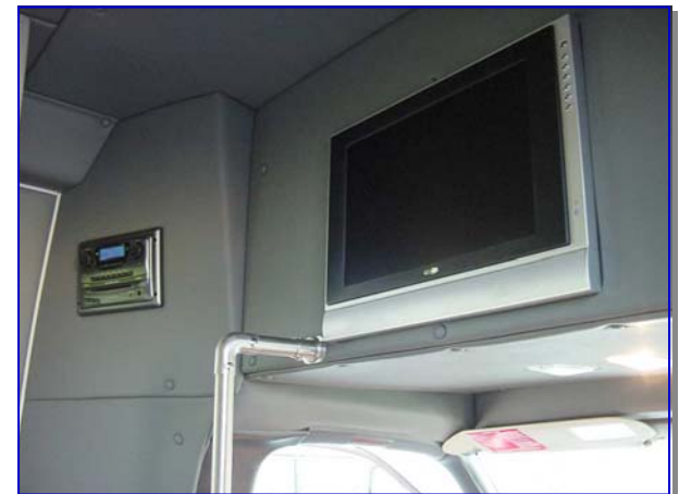
TV and CD/DVD player for training sessions