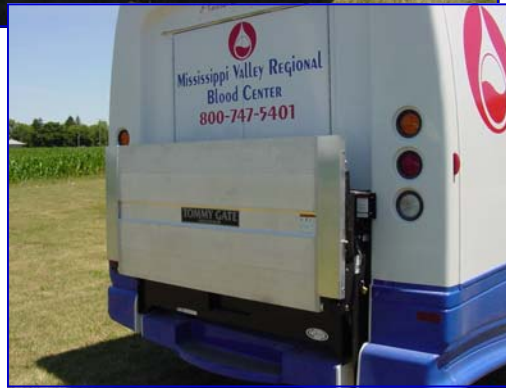
Semi-automatic Tommy Gate lift facilitates loading and unloading equipment