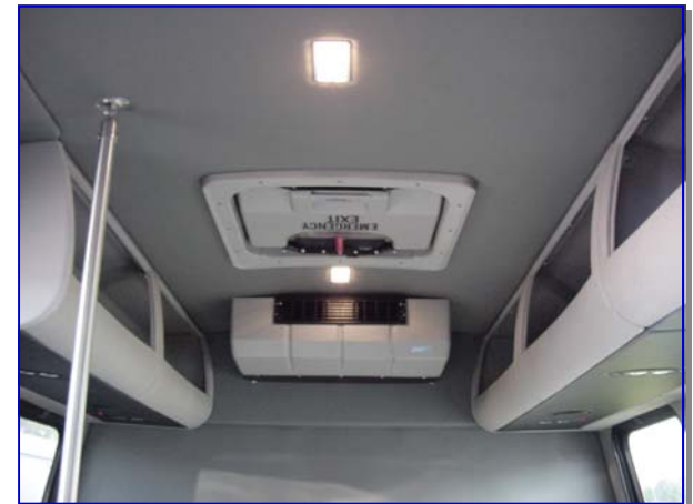
Overhead storage for small personal items Air conditioned cabin